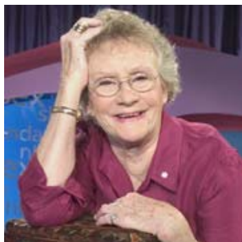
Sue Johanson, Canada's foremost sexual educator